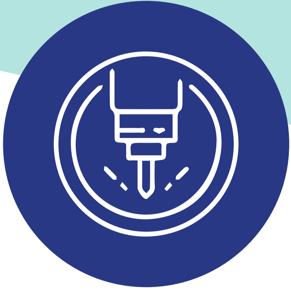
5-Axis Machining Centers

Backed by advanced manufacturing facilities, we bring together cutting-edge technology and experienced professionals to deliver superior products. Our factories are equipped with: